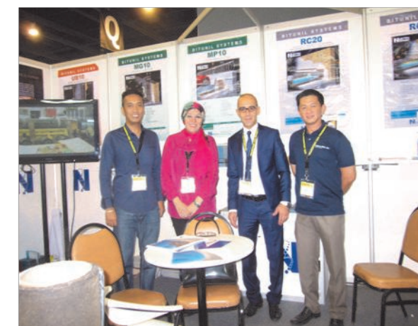
Phil Construct 2014 -Philippines