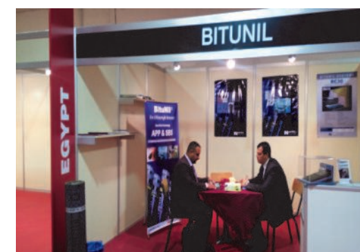
Barsha Build 2014– Iraq