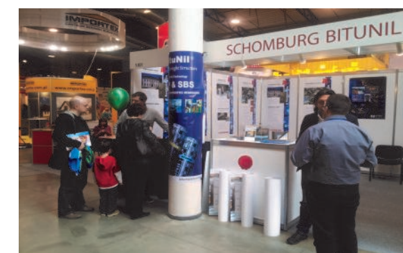
RESTA 2014- Lithuania